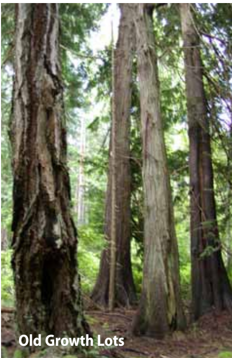
Old Growth Lots

We are now thrilled to report that using the funds raised by the community last summer, SILT is in the midst of purchasing alternative lands with significant ecological value. The board considered 10 possible acquisition projects over the island and ultimately endorsed one project which included 5 lots, in 2 different parts of the island.